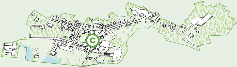
Location: Downtown / Waterfront Area