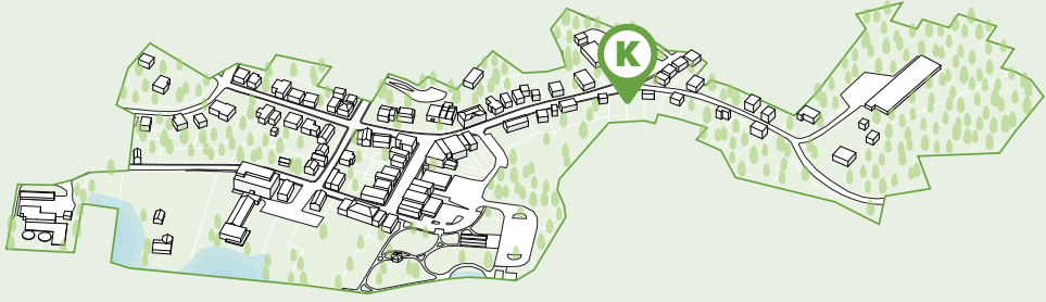
Location: 1, 3, 5 Riverside Ave