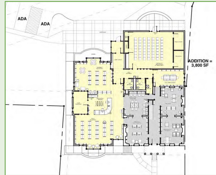
Left: Preliminary Ground Floor Plan of the Library Renovation

Located in the historic Reed Street district in the Village of Coxsackie, the Library sits at the front of the hill and represents a space of information, learning, and access for all. Our Library provides access to information and technology. We focus on a wide range of populations with particular needs at our Library, including children, seniors, veterans, and immigrants. From our connection with the community, the Library has a trusted role to serve as a community space. We provide assistance through the Healthcare Consortium to find affordable healthcare insurance. We provide information on local food pantry access and offer food programming when funding is available, as well as help those with employment and housing needs to navigate social services. We help new businesses print and copy flyers. People of all backgrounds, all phases of life use our library. We offer early literacy programming for young patrons and artistic enrichment for community members through classes. We serve an aging population through outreach to Bethany Village, and also provide caregiver support and Alzheimer support groups. Public libraries are dynamic, socially responsive institutions, a nexus of diversity, and a lifeline for the most vulnerable among us. We aim to implement improvements to our building and grounds to ensure that this access to such a wonderful public institution remains as available, accessible, and approachable for all members of our community for years to come.