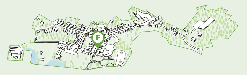
Location: 3-7 Reed Street