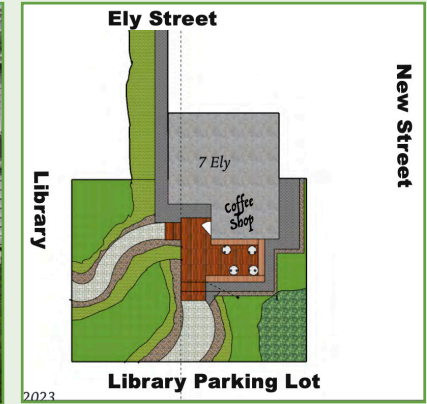
Above, Left: Proposed program