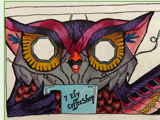
Left: Mural art for 7 Ely Coffee Shop