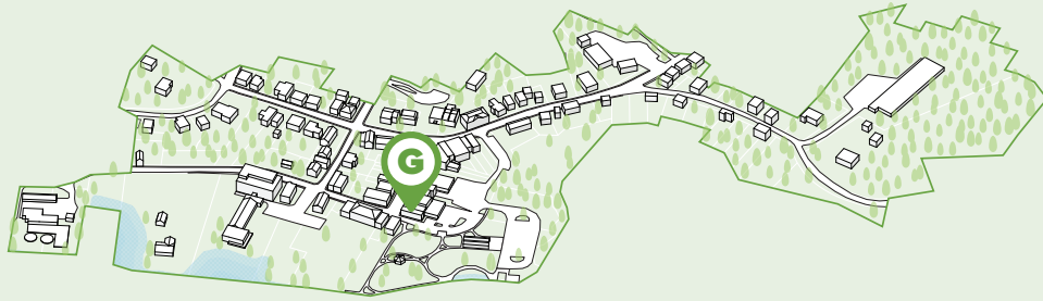
Location: 1 Reed Street